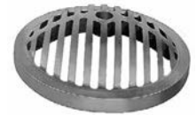
Type O1 Beehive Grate Approx. 135 sq. in. open area 4\"/>